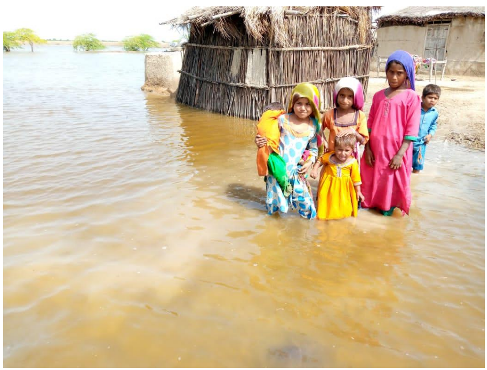
Pakistan Sindh Province Floods, 2022.

The CCDR will need to clarify the pathway forward for Pakistan to decarbonize its energy mix, particularly on the scope, extent and timeline for the proposed complete phaseout of coal. It also needs to specify the nature and quantity of the Bank's financial commitment to the decommissioning of legacy coal and fuel projects: Pakistan cannot act at the speed needed without external support.