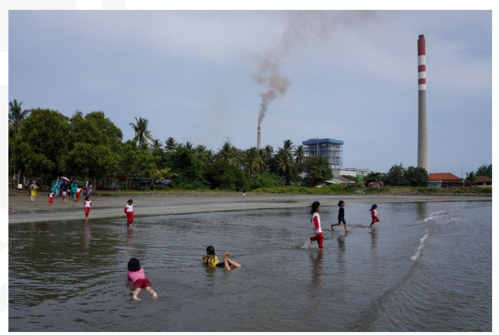
Java 9 & 10 coal plants, Indonesia.

This project is an example of the WBG's climate impacts through indirect loans, through financial intermediaries, making them harder to oversee and potentially allowing climate lending pledges to be worked around. The IFC was instrumental in founding Hana Bank Indonesia (HBI) as a subsidiary of South Korea's Hana Bank, providing $65 million in equity and loans since 2007. In May 2019, the IFC took an equity stake in HBI, signing the bank up to its Green Equity Approach. However, in July the following year, HBI and its parent company in South Korea provided project loans to PT Indo Raya Tenaga to develop the Java 9 and 10 coal plants.