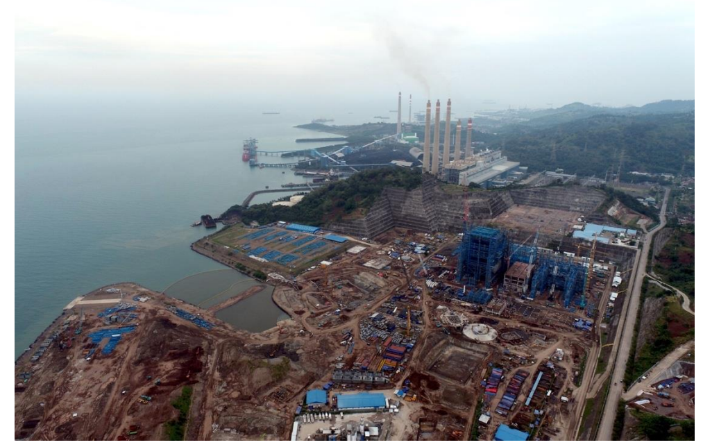
Java 9 & 10 coal plants, Indonesia.

The 2,000 MW Java 9 & 10 coal plants in Indonesia, currently under construction, are the latest additions to Indonesia's largest coal complex - the 4,065MW Suralaya power plants in Banten province. As their name suggests, the latest two coal plants will add to the eight existing at Suralaya, increasing the burden of social and environmental impacts on local communities.