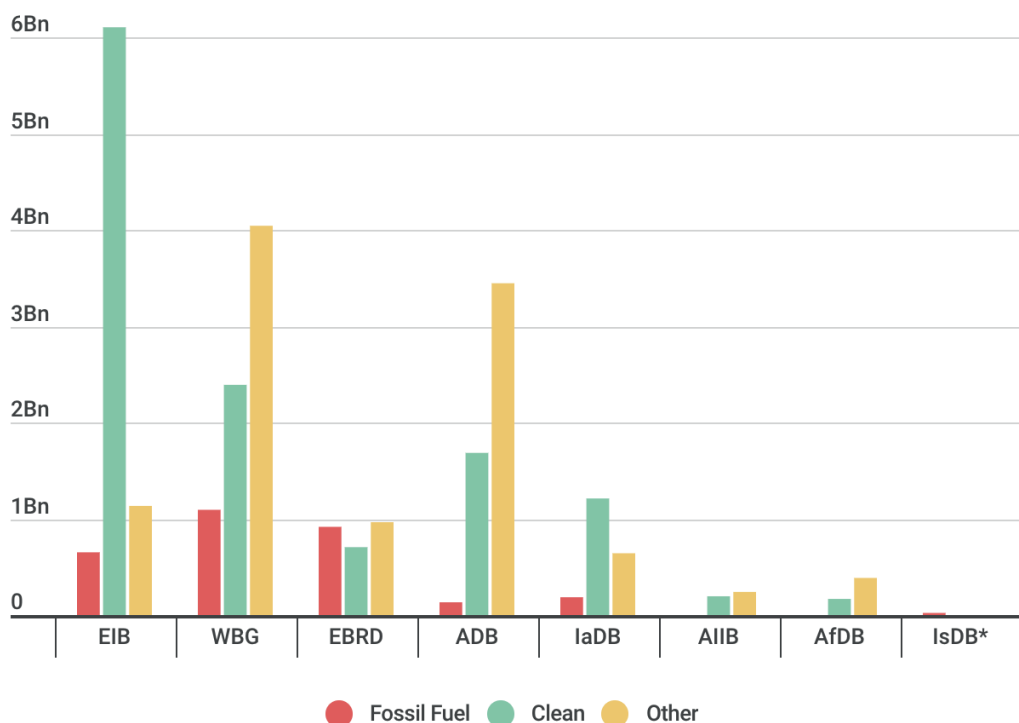
Figure 2: Total project financing for all energy sources from MDBs in 2020

The EBRD portfolio, as highlighted above, stands out again, with investments in clean energy totalling $705 million. Shockingly, this figure is $210 million lower than the Bank's fossil fuel investments. This is disgraceful in the context of both Europe's progressive position on climate action 20 , and given the EBRD's own Green Economy Transition Approach, 21 which is stated to be "helping economies where the EBRD works build green, low carbon and resilient economies".