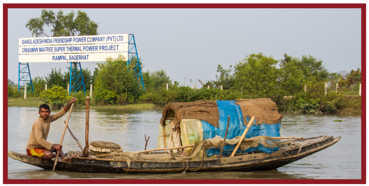
Rampal is expected to have disastrous impacts on the 2 million people who depend on the Sundarbans.

"These exits were planned for sometime, following improved market conditions in India," the statement said. The IFC did not elaborate on what it meant by improved market conditions, nor would it specify precisely when it exited the investments. At the time, however, India's economy was in turmoil due to the demonetization crisis. In the months following the Indian government's decision to swap old currency notes for new bills, on November 8, 2016, the economy <u>suffered</u> a meltdown that saw contractions in a number of sectors, including manufacturing and real estate, and created cash shortages that disproportionately hurt the rural poor.