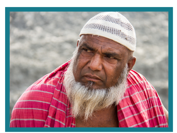
Some 2,000 families were displaced to make way for the Rampal plant. Most have left the area in search of menial work.

lamities. Every year, the monsoon rains join forces with dozens of rivers, swollen by melted Himalayan ice and snow, to submerge large parts of the country. The monsoon floods in 2007, described at the time as the worst in living memory, killed 1,100 people and damaged or destroyed 1.1 million homes. Cyclones are also a perennial worry. Last year, Cyclone Roanu unleashed a three-meter-tall wall of water that roared through seaside villages, killing dozens and causing extensive damage.